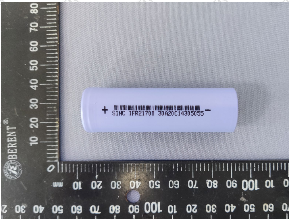
Figure 4 Overall view of cell (电芯图)