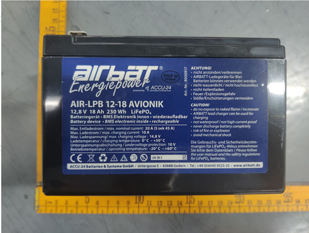
Figure 3 Battery Label (标签)